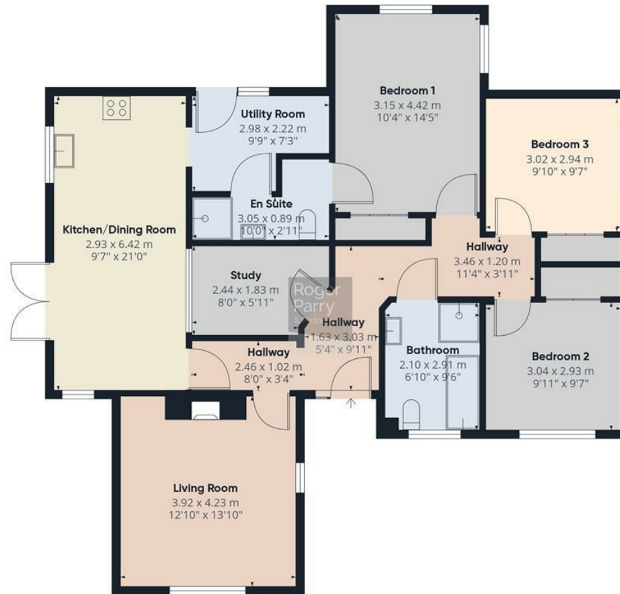
Ground floor Building 1