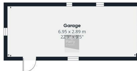
Ground floor Building 2